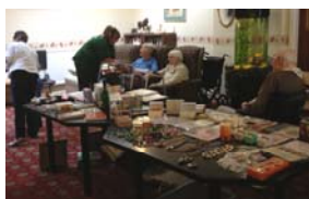
We had a very successful Summer Fair